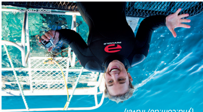
Book your experience through YHA Travel and Tours (yha.com.au/travel)

Jump out of a plane above the gorgeous Fleurieu Peninsula.